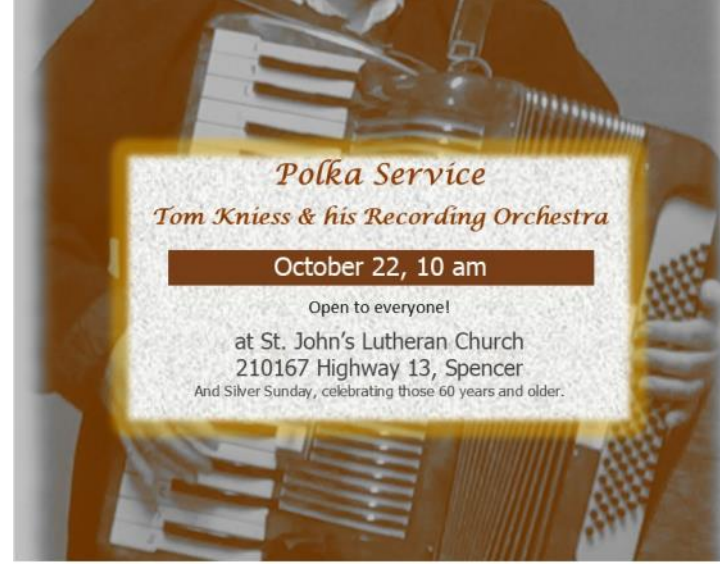
Brats, root beer floats and dessert will be served following worship. Invite your friends and family.

Need more information: Call 715-659-5158